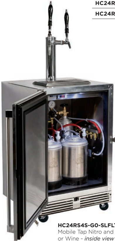
HC24RS4S-GO-SLFLT Mobile Tap Nitro and Coffee or Wine - inside view