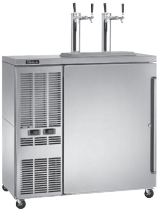
DZS36 - Shown with optional 2-faucet dual draft arms

* Wine temperature not approved for open food storage.