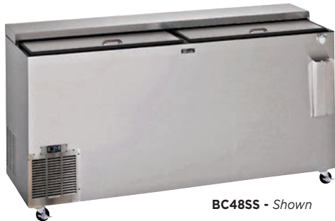
BC48SS - Shown