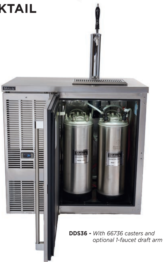
DDS36 - With 66736 casters and optional 1-faucet draft arm