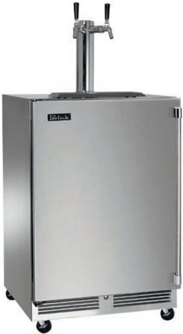
HC24RS4S-JO-SLFLT Mobile Tap Beer Dispensers