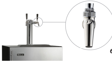
630SS Forward Sealing Beer Faucet