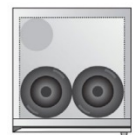
Two 1/6 barrel