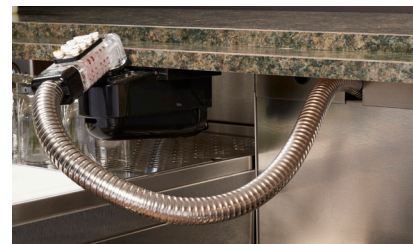
Note: Soda gun system not included. Shown for clarity only.