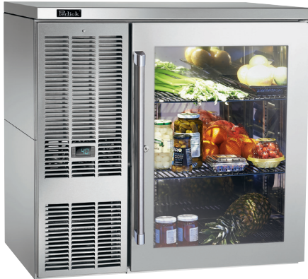
BBS36 with optional glass w/stainless steel door shown