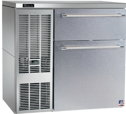
BBS36 with optional liquor drawers shown