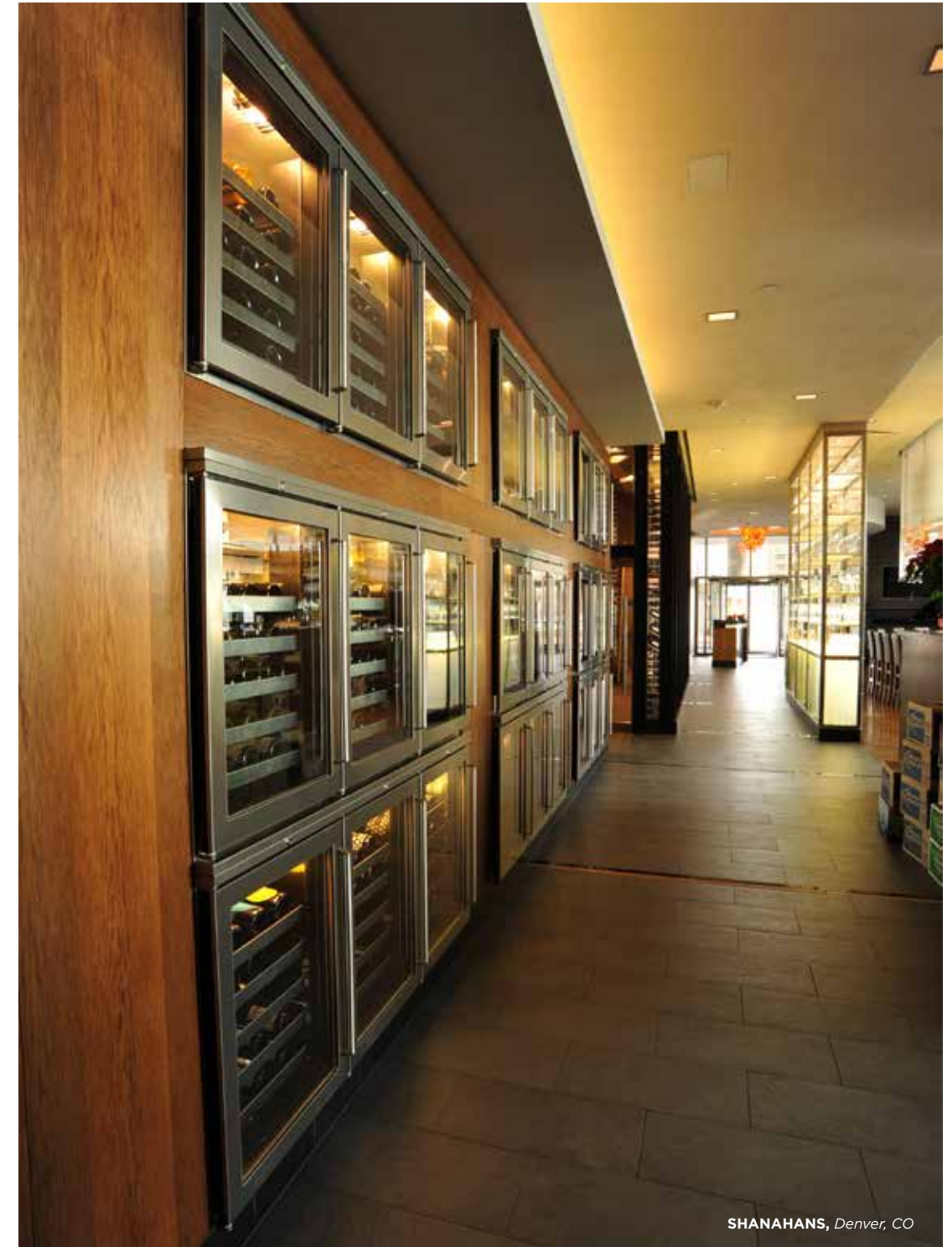
SHANAHANS, Denver, CO