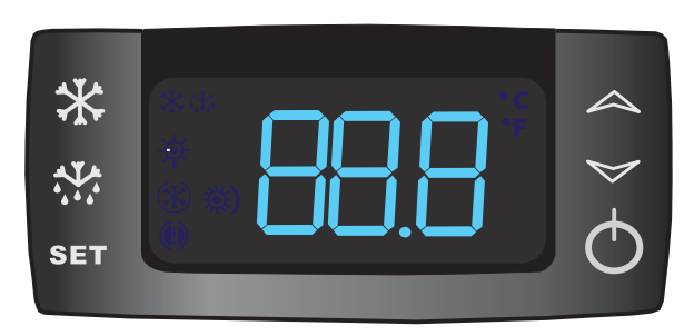
Figure 2. Digital Temperature Controller HP & HH models feature a blue display HC & HA models feature a red display