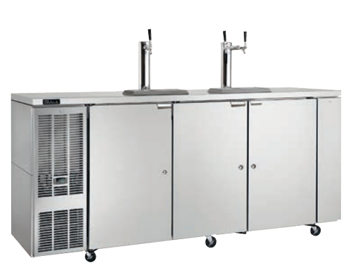
DDC92 - Shown with optional 1-faucet and 2-faucet draft arms