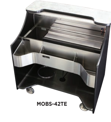
42" Signature Mobile Bar Designed by Tobin Ellis Model Number - MOBS-42TE