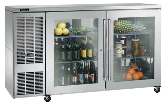
BBS60 - Shown