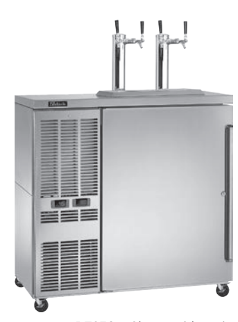
DZS36 - Shown with optional 2-faucet dual draft arms