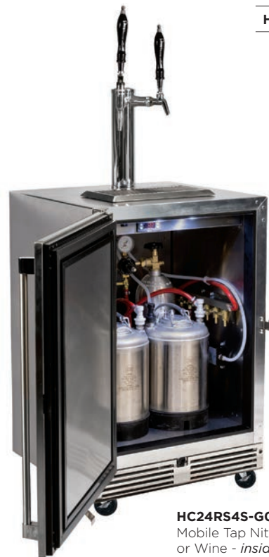
HC24RS4S-GO-SLFLT Mobile Tap Nitro and Coffee or Wine - inside view