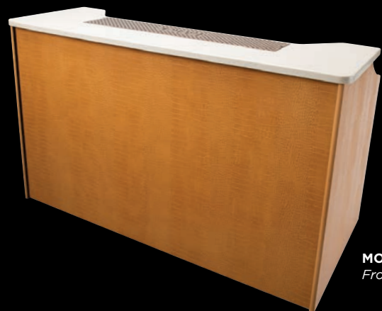
MOBS-66LE Front view