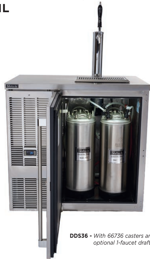
DDS36 - With 66736 casters and optional 1-faucet draft arm