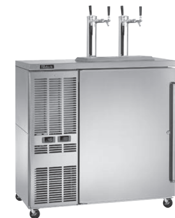
DZS36 - Shown with optional 2-faucet dual draft arms

* Wine temperature not approved for open food storage.