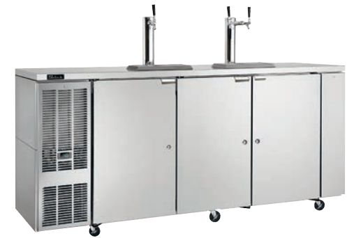
DDC92 - Shown with optional 1-faucet and 2-faucet draft arms