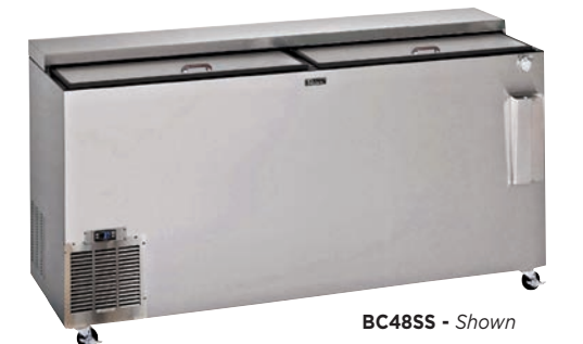
BC48SS - Shown