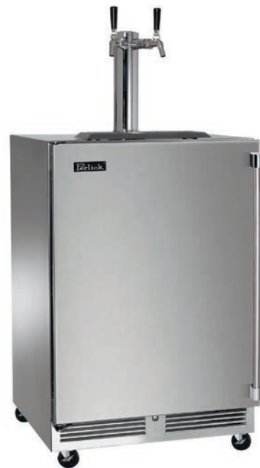
HC24RS4S-JO-SLFLT Mobile Tap Beer Dispensers