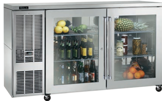
BBS60 - Shown