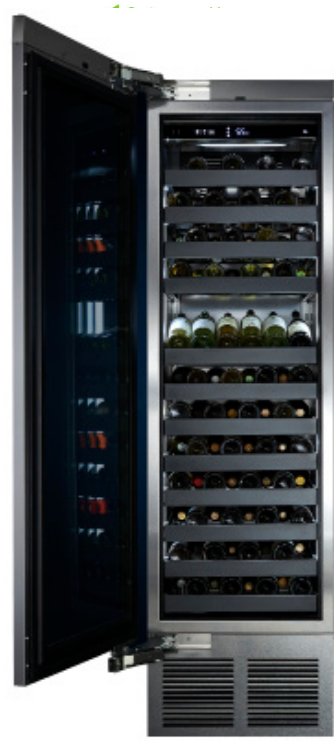
JOB AREA ITEM NO. MODEL NO.