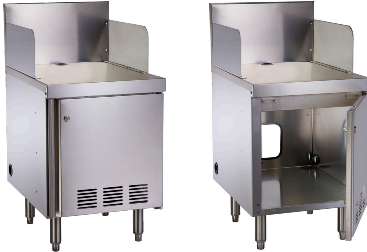
TSF18POS with optional door and end splashes