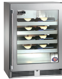
Wine Reserve (HC24WS4)