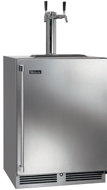
Beverage Dispenser (HC24RS4-T1) Shown with 2-faucet draft arm tapping option