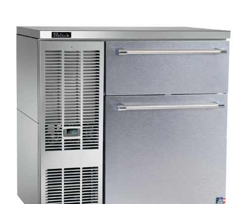
BBS36 with optional liquor drawers shown