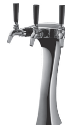
Panther Arm (3 faucet, shown)

Order online at perlick.com or by phone at (800) 558-5592