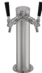
Draft Arm (2 faucet, shown)