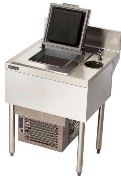
TSD24DC-A shown with 8000A installed