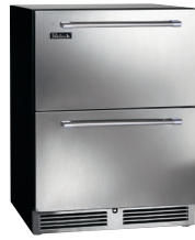
HB24FS Freezer Drawers