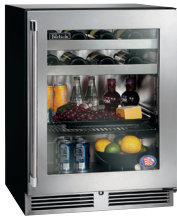
HB24BS Beverage Center