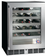
HB24WS Wine Reserve