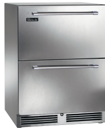
HB24FS4 Freezer Drawers