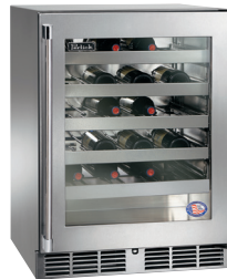
HB24WS4 Wine Reserve