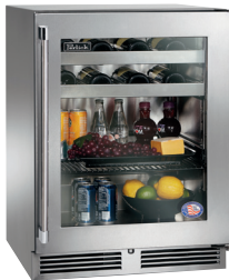
HB24BS4 Beverage Center