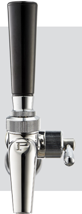
650SS Flow Control

P erlick's Forward Sealing Beer Faucets are unique in both appearance and function. The revolutionary ball and floating O-ring design eliminates the need for a valve shaft. Beer is not exposed to air so the handle lever doesn't stick, and there is no build up of mold and bacteria in the faucet body. The polished interior produces a smooth flow with less foaming, ensuring a perfect pour each and every time. Fewer internal parts means better reliability and fewer service calls. This faucet will fit all standard North American shanks.